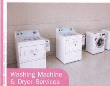
Washing Machine & Dryer Services